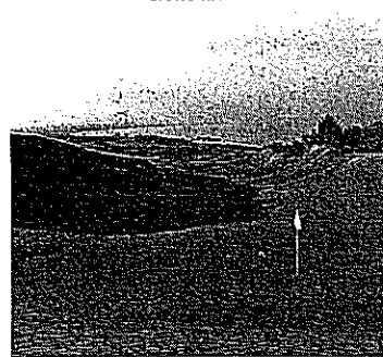
Prime spots (from left): Chambers Bay, overlooking Puget Sound; Vermont's Stowe Mountain Club