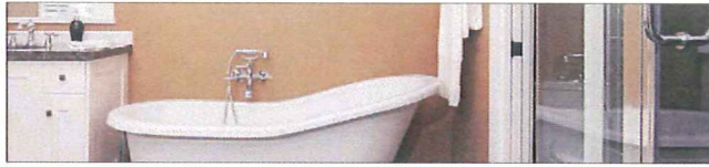
BROKER-BUILDER COLLABORATION A SUCCESS IN WHITE ROCK | L1