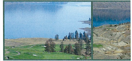
Tobiano features two stretches of memorable holes (from left): hole 13, a par 5; the 7th

seem adequate. Soaring above the shores of Kamloops Lake, Tobiano is built on one of the most impressive pieces of property made available for golf in Canada in recent memory (all 18 holes have unrestricted lake views).