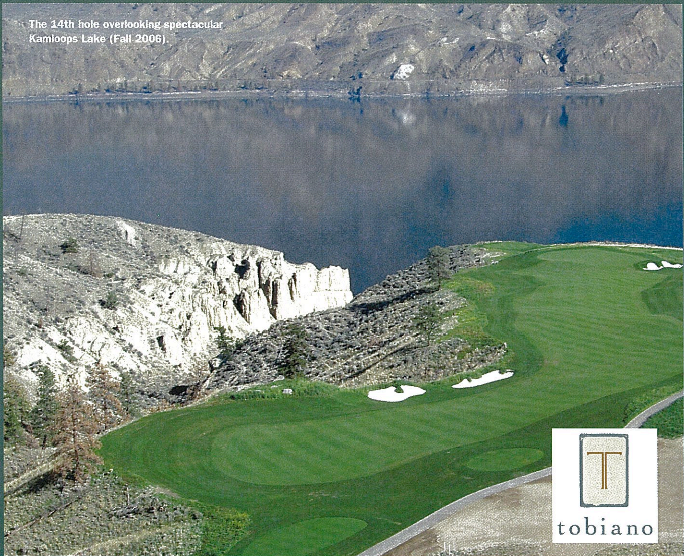
The 14th hole overlooking spectacular Kamloops Lake (Fall 2006).

Of course, when the site truly is amazing, as in the case of Thomas McBroom's new Tobiano 18-hole championship golf course in Kamloops, B.C., the superlatives barely >